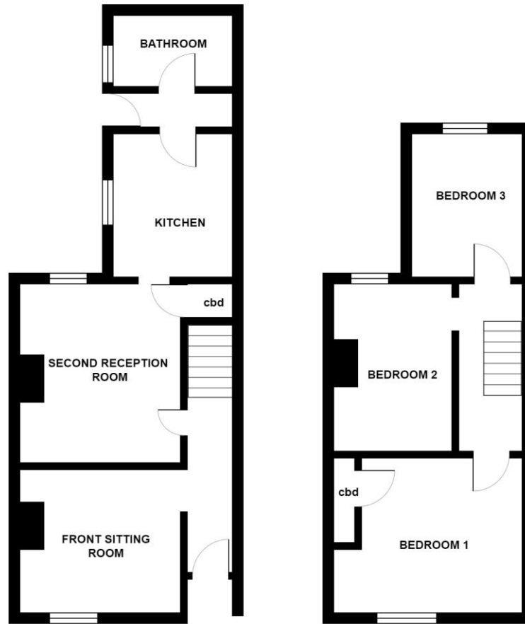
All measurements are approximate and for display purposes only