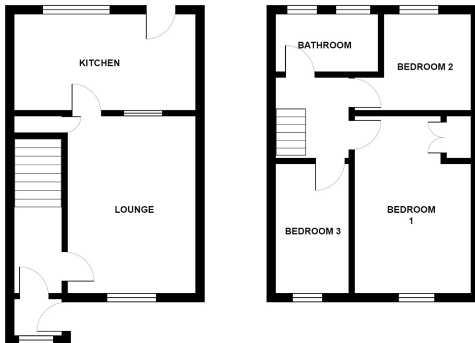
DRAFT FLOOR PLAN ONLY - AWAITING VENDORS APPROVAL

All measurements are approximate and for display purposes only