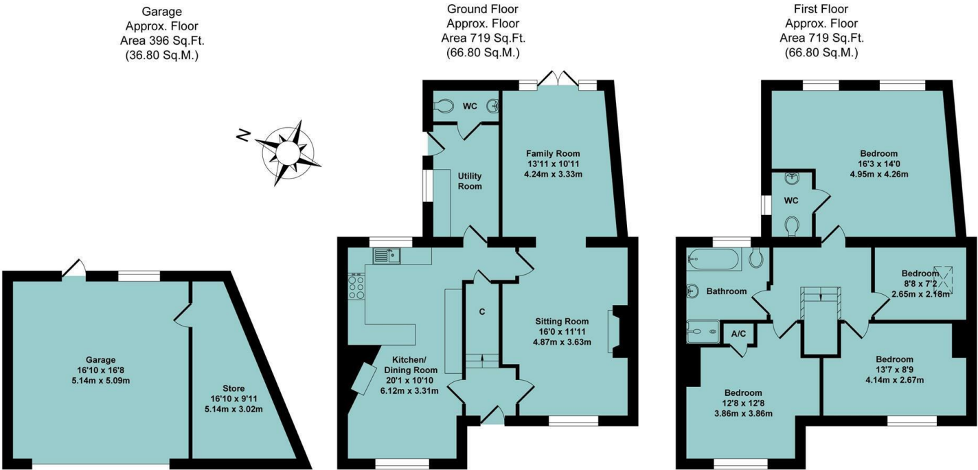
Total Approx. Floor Area 1834 Sq.Ft. (170.40 Sq.M.) All items illustrated on this plan are included in the "Total Approx Floor Area"

Anker and Partners earn supplementary income from various sources relating to the provision, referral and introduction of services and products to our clients and customers. This may be in the form of a fixed fee or a percentage of a premium, fee or invoice. This is not done in all cases and use of these providers/suppliers is not mandatory. Clients are entirely free to choose their own products, services and providers. We declare this intention within our Terms of Business and by signing these documents our clients and customers confirm their agreement in doing so.