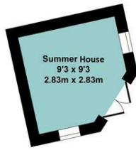
Outbuilding Approx. Floor Area 79 Sq.Ft. (7.30 Sq.M.)