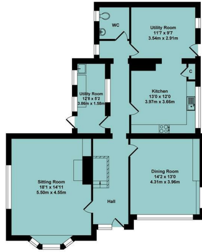
Ground Floor Approx. Floor Area 1076 Sq.Ft. (100.0 Sq.M.)