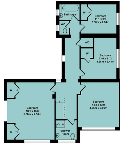
First Floor Approx. Floor Area 998 Sq.Ft. (92.70 Sq.M.)