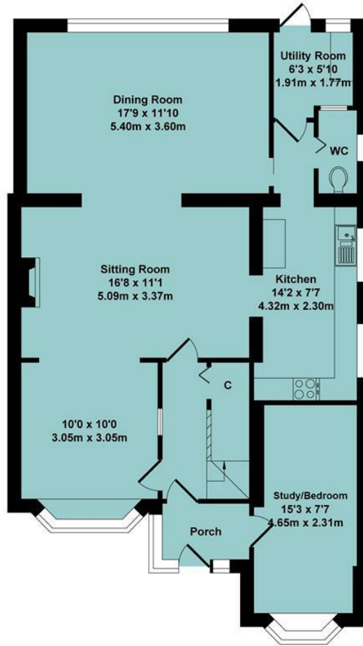
Ground Floor Approx. Floor Area 940 Sq.Ft. (87.30 Sq.M.)