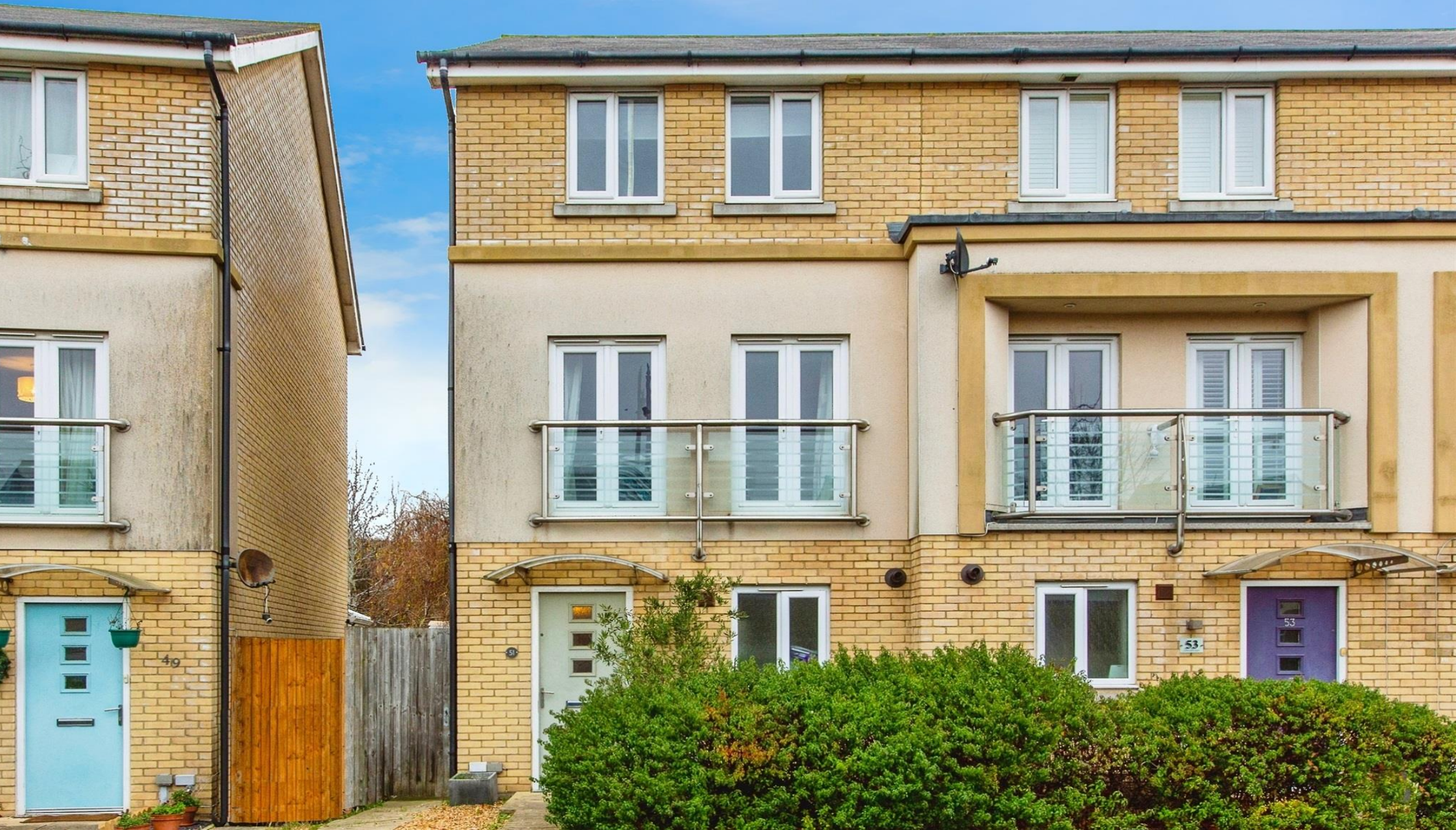
Lancaster Gate Upper Cambourne