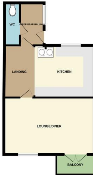
1ST FLOOR 479 sq.ft. (44.5 sq.m.) approx.