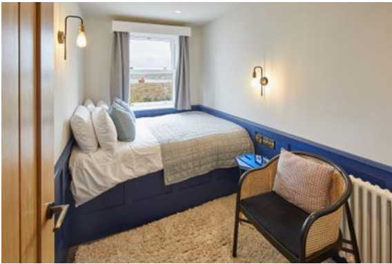
BEDROOM THREE 11' 2" x 6' 4" (3.4m x 1.93m)

The second bedroom is configured with two twin, four-poster beds.