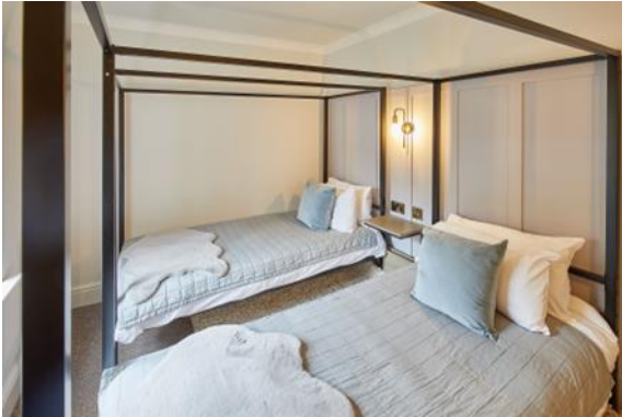
BEDROOM TWO 11' 3" x 8' 2" (3.43m x 2.49m)

The second bedroom is configured with two twin, four-poster beds.