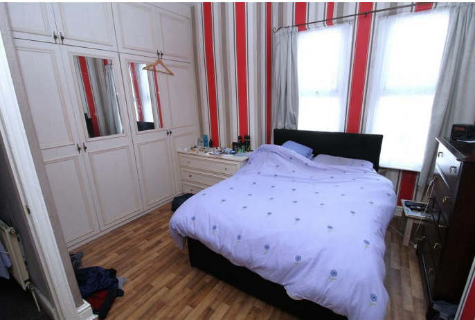
two uPVC double glazed window to front aspect, radiator, fitted wardrobes, built in cupboard