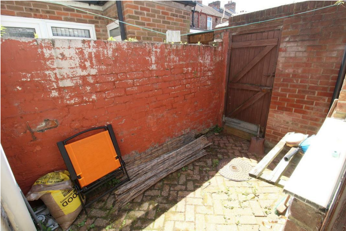
block paved courtyard with gated access to rear

Tenure : Freehold Council Tax Band : A Local Authority : Liverpool