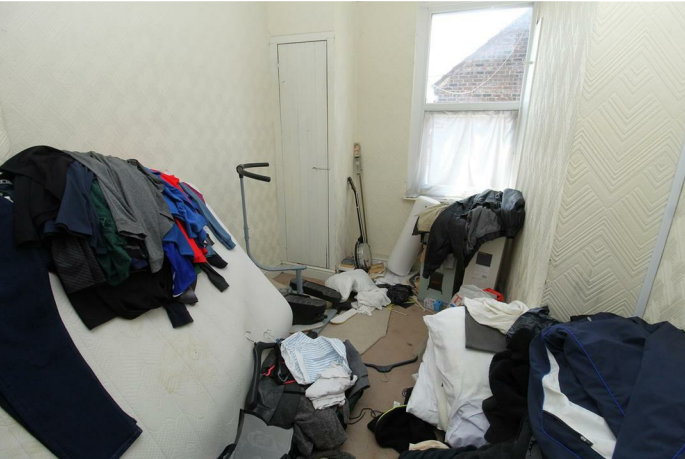
uPVC double glazed window to rear aspect, radiator, built in cupboard