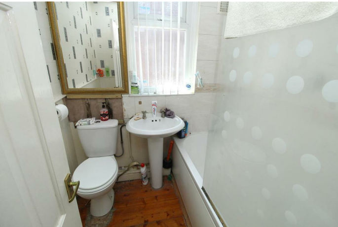
white suite comprising; panelled bath with shower mixer tap, wash hand basin and low level w.c., radiator, part tiled walls, loft access, uPVC double glazed frosted window to rear aspect