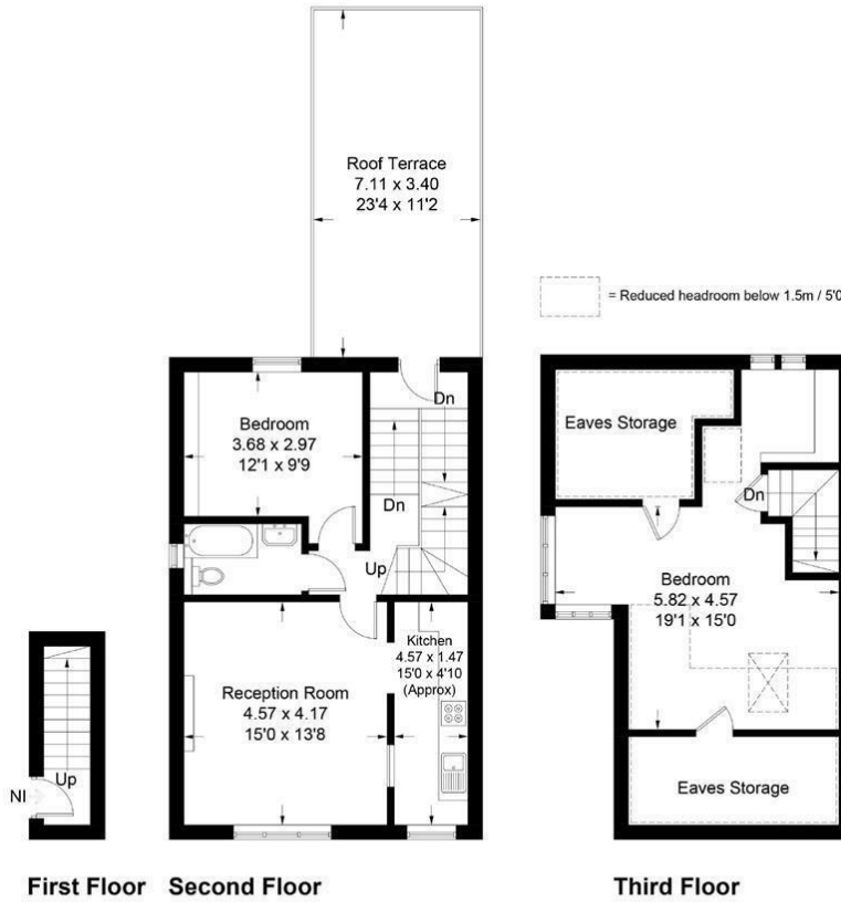
Illustration for identification purposes only, measurements are approximate, not to scale. (ID548068)