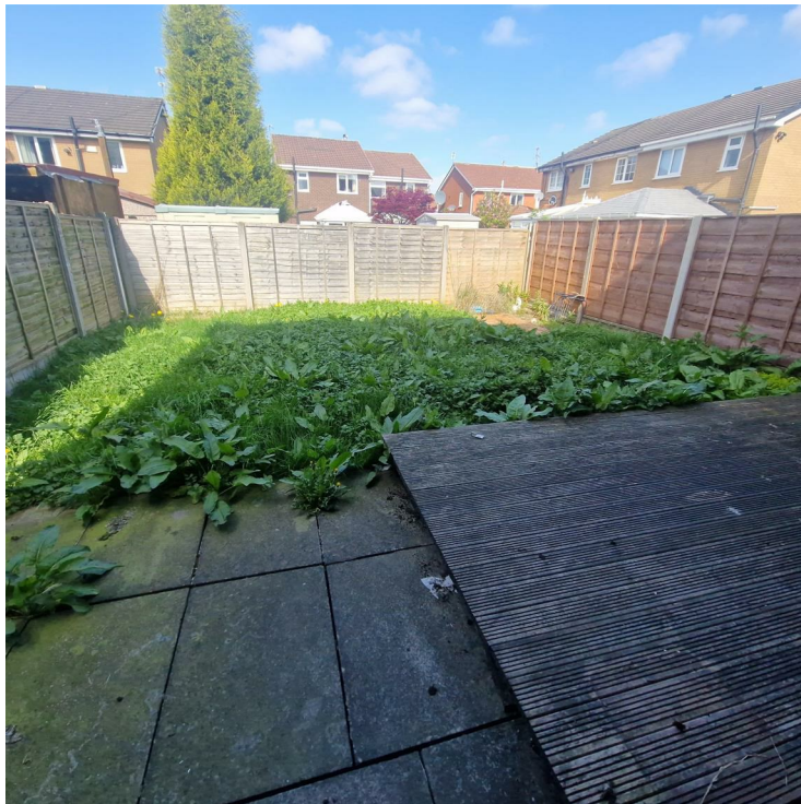
Off road parking at the front, private rear garden.