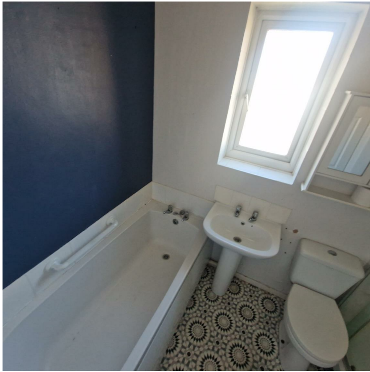
Three piece white suite plus a shower cubicle.