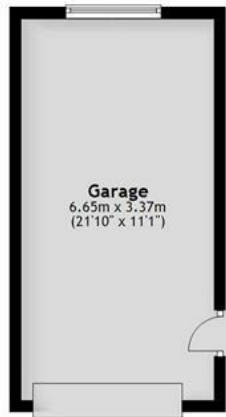
Outbuilding Approx. 22.4 sq. metres (241.2 sq. feet)