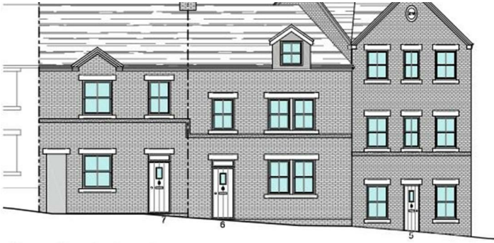
Alsop Street Elevation