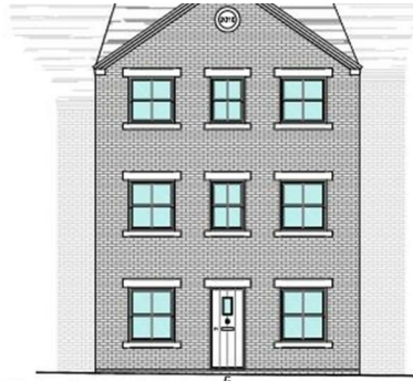
Alsop/Broad Street Elevation