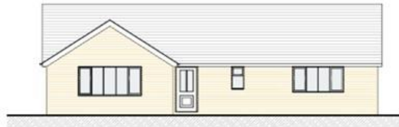
South Elevation Scale 1:50