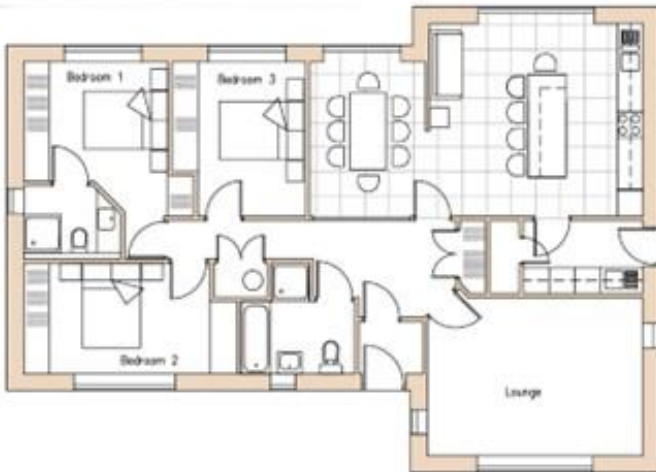
Floor Plan Scale 1:50