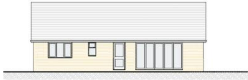
West Elevation Scale 1:50