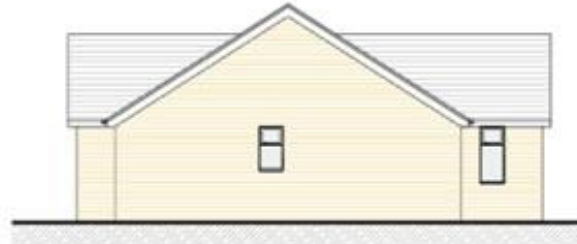
West Elevation Scale 1:50