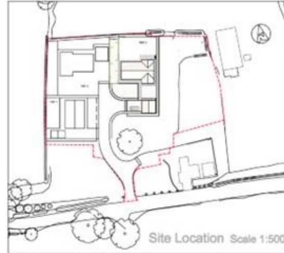
Site Location Scale 1:500

Model advertisement, 2000-1/2, is hereby approved for printing and its contents have been published in the Official Gazette and is not intended for any other person or for any other purpose than the Official Gazette. In all of the printing and circulation printed materials may be reprinted, copied, modified or otherwise, without the prior written consent of the Government of Canada.