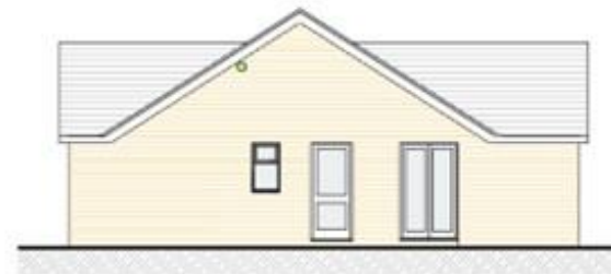
West Elevation Scale 1:50