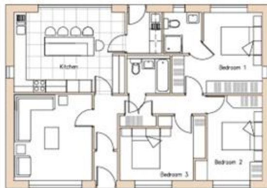
Floor Plan Scale 1:50