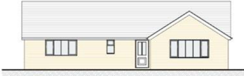
South Elevation Scale 1:50