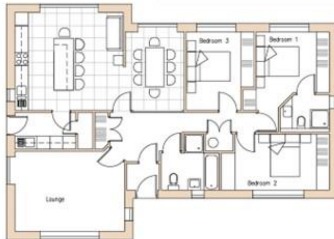
Floor Plan Scale 1:50