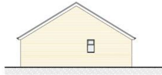
North Elevation Scale 1:50