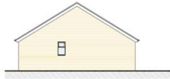
South Elevation Scale 1:50