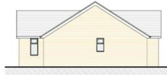
East Elevation Scale 1:50