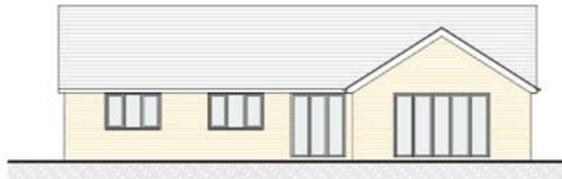
North Elevation Scale 1:50