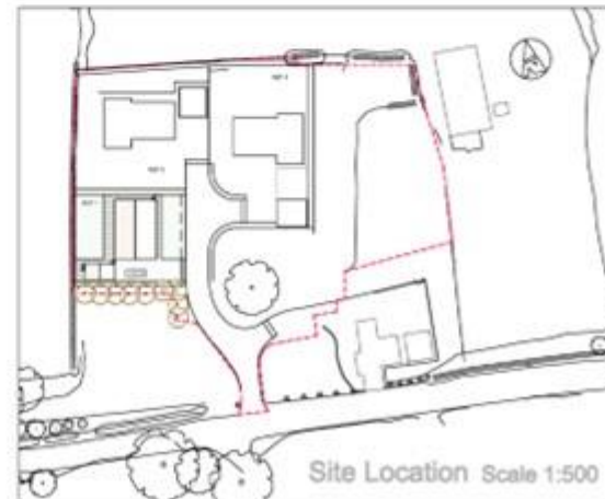
Site Location Scale 1:500

These drawings are the property of the Architect and are not to be used for any other purpose without the written consent of the Architect. The drawings are not to be used for any other purpose without the written consent of the Architect.