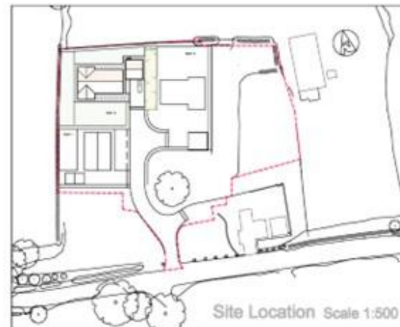
Site Location Scale 1:500

These drawings are to be used for planning purposes only. They are not to be used for construction purposes. The drawings are the property of the architect and are not to be reproduced without written permission. The drawings are not to be used for any other purpose without the written consent of the architect.