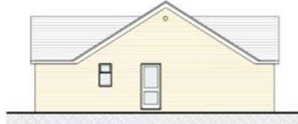
East Elevation Scale 1:50