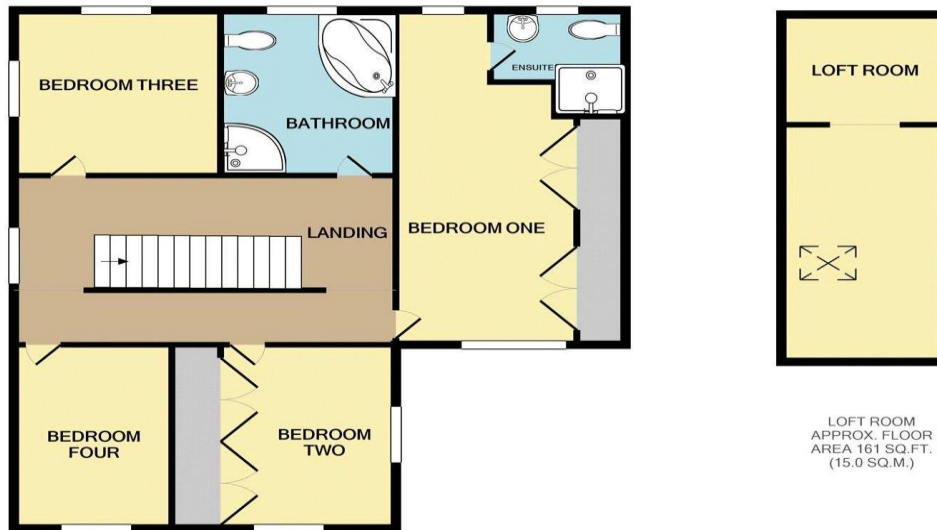
1ST FLOOR APPROX. FLOOR AREA 872 SQ.FT. (81.0 SQ.M.)