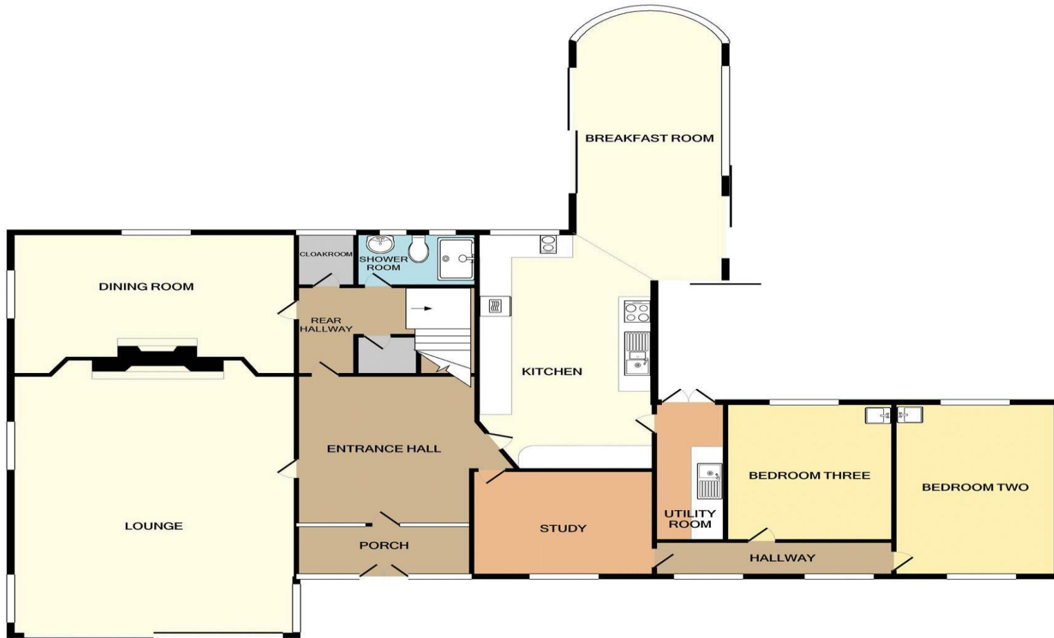
GROUND FLOOR APPROX. FLOOR AREA 1894 SQ.FT. (176.0 SQ.M.)

TOTAL APPROX. FLOOR AREA 2605 SQ.FT. (242.0 SQ.M.) Whilst every attempt has been made to ensure the accuracy of the floor plan contained here, measurements of doors, windows, rooms and any other items are approximate and no responsibility is taken for any error, omission, or mis-statement. This plan is for illustrative purposes only and should be used as such by any prospective purchaser. The services, systems and appliances shown have not been tested and no guarantee as to their operability or efficiency can be given. Made with Metropix ©2021