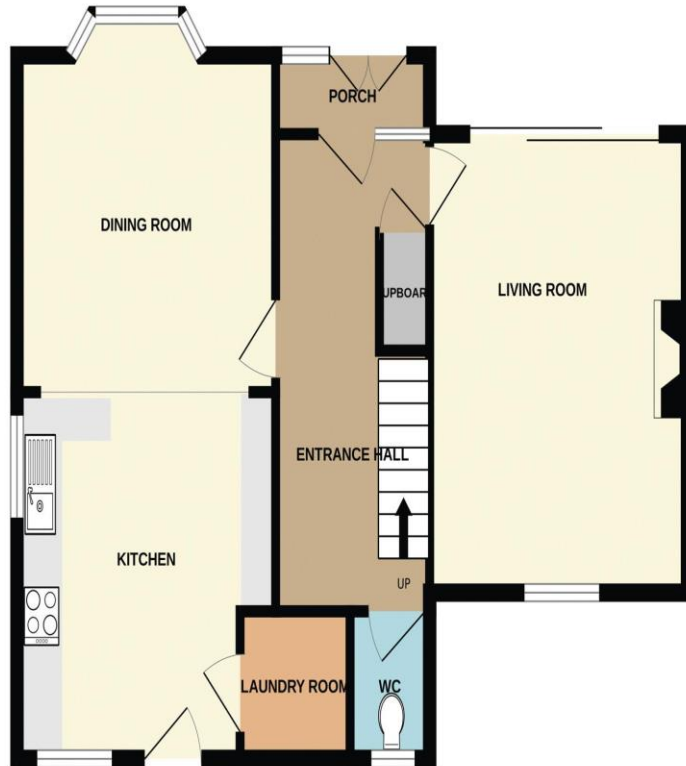
GROUND FLOOR 581 sq.ft. (54.0 sq.m.) approx.