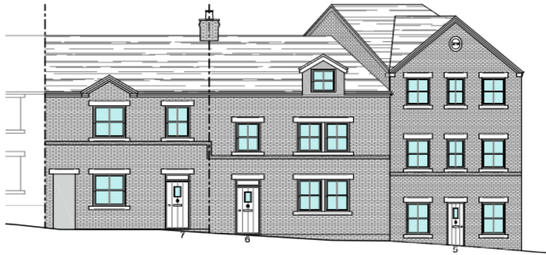
Alsop Street Elevation