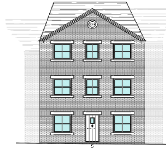
Alsop/Broad Street Elevation