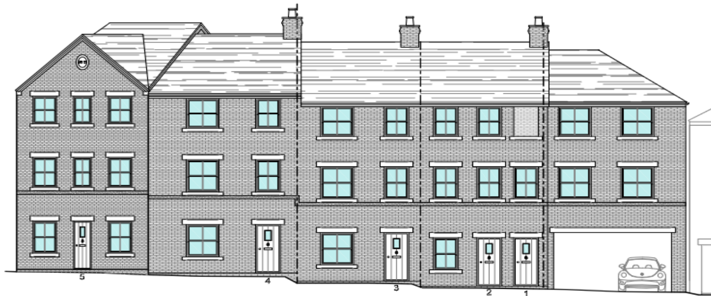
Broad Street Elevation