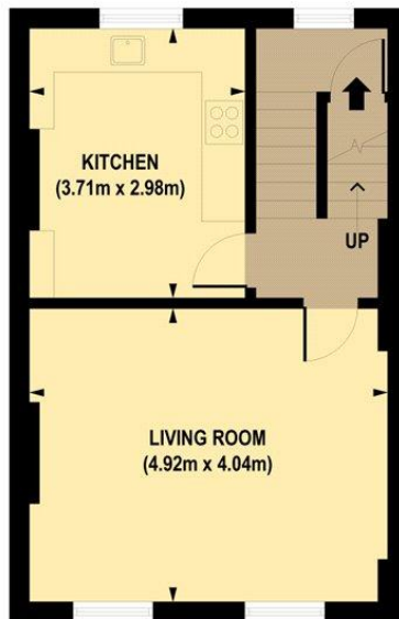
FIRST FLOOR GROSS INTERNAL FLOOR AREA 413 SQ FT

APPROX. GROSS INTERNAL FLOOR AREA 841 sq. ft / 78.10 sq. m