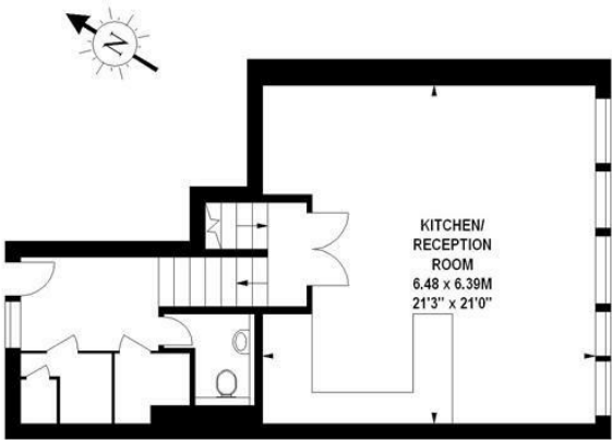
Third Floor 618 sq ft

Approximate gross internal area 116.22 sq m / 1251 sq ft