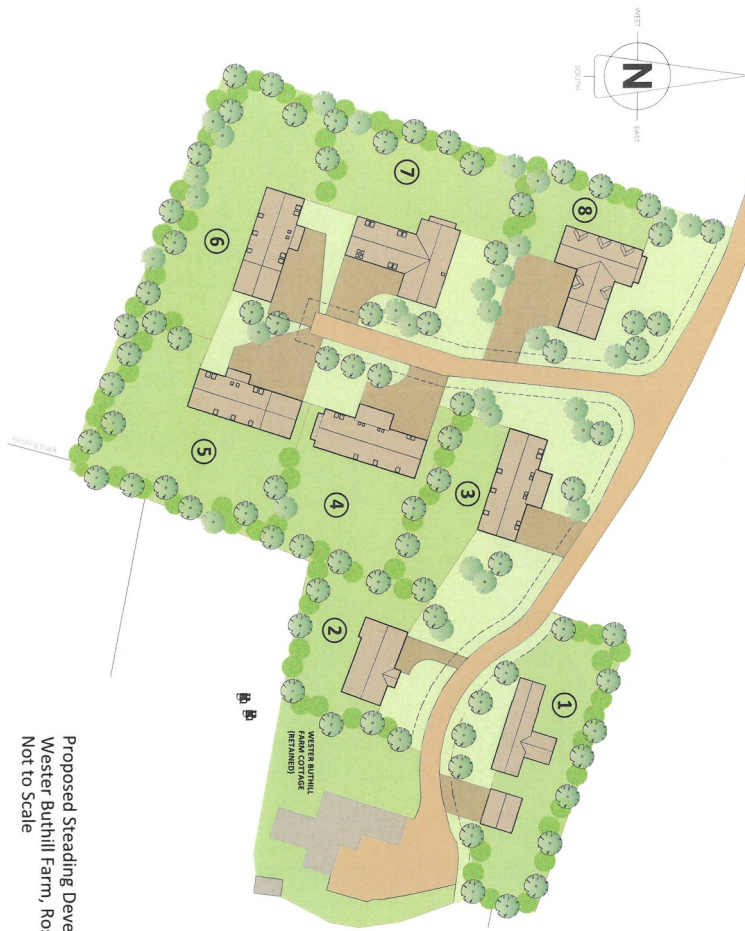
Proposed Steading Development at Wester Buthill Farm, Roseisle, Moray Not to Scale