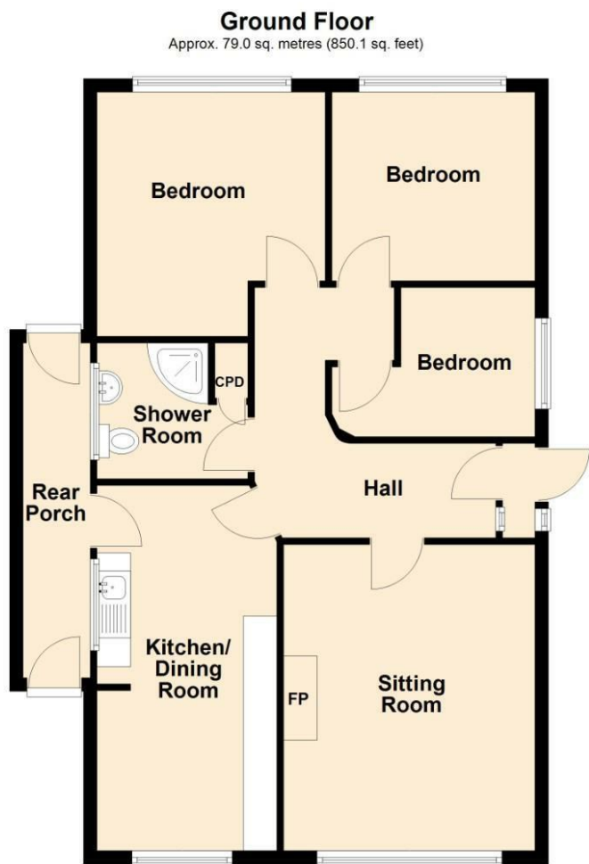
Total area: approx. 79.0 sq. metres (850.1 sq. feet)