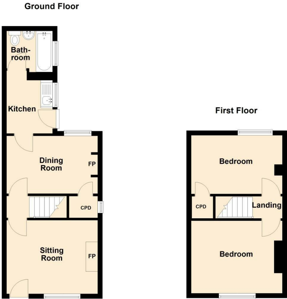
Total area: approx. 59.7 sq. metres (643.0 sq. feet)