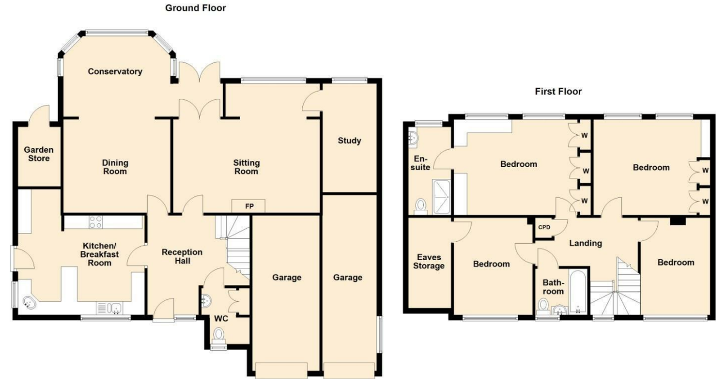
Total area: approx. 213.7 sq. metres (2300.2 sq. feet)