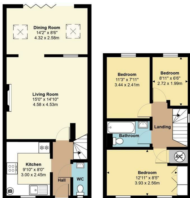
Ground Floor Area: 511 ft 2 ... 47.4 m 2