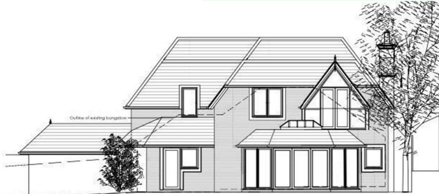
DATE: 10.08.2020 PROPOSED NORTH WEST ELEVATION SCALE: 1/50