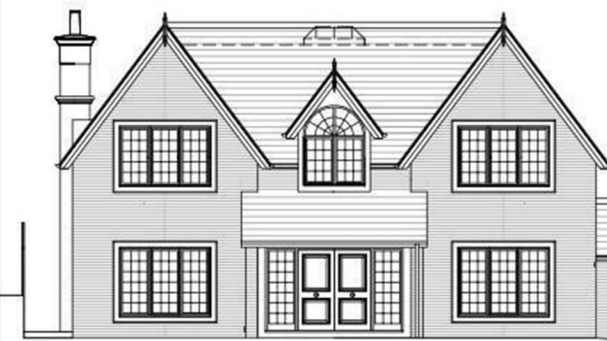
DATE: 10.08.2020 PROPOSED SOUTH EAST ELEVATION SCALE: 1/50