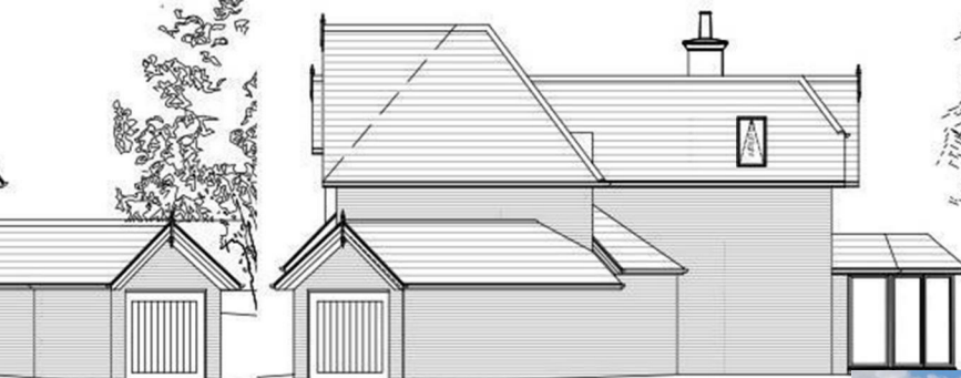
DATE: 10.08.2020 PROPOSED NORTH EAST ELEVATION SCALE: 1/50