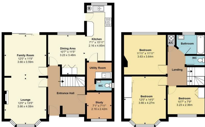
Ground Floor Area: 797 ft 2 ... 74.0 m 2