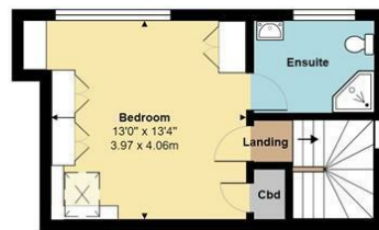
Second Floor Area: 293 ft 2 ... 27.3 m 2