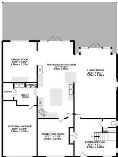
GROUND FLOOR 1647 sq.ft. (153.0 sq.m.) approx.