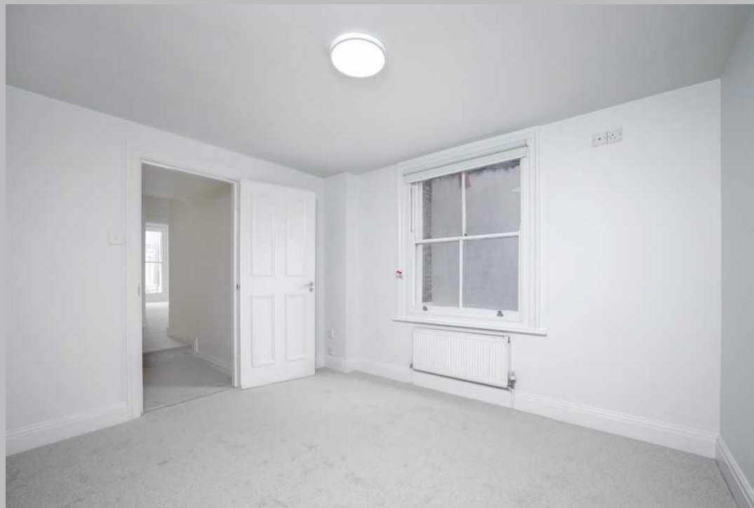
A modern, newly redecorated 3 bed 2 bath split-level apartment in Fulham