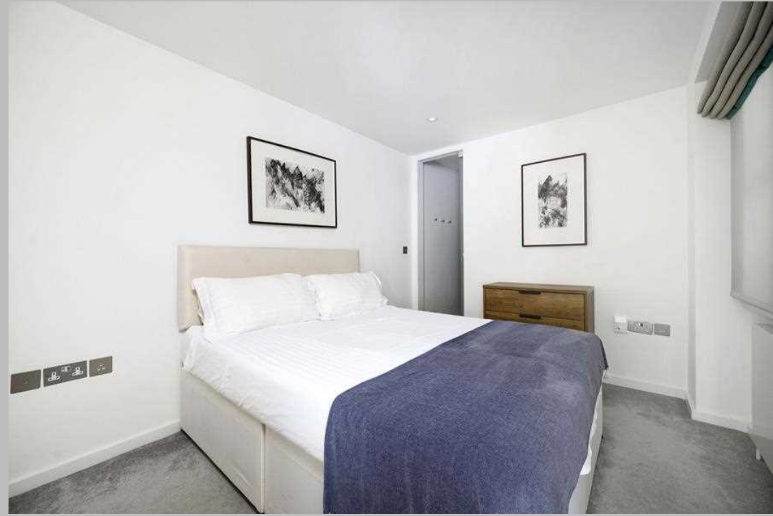
An exquisitely presented one bed flat moments from Gloucester Road