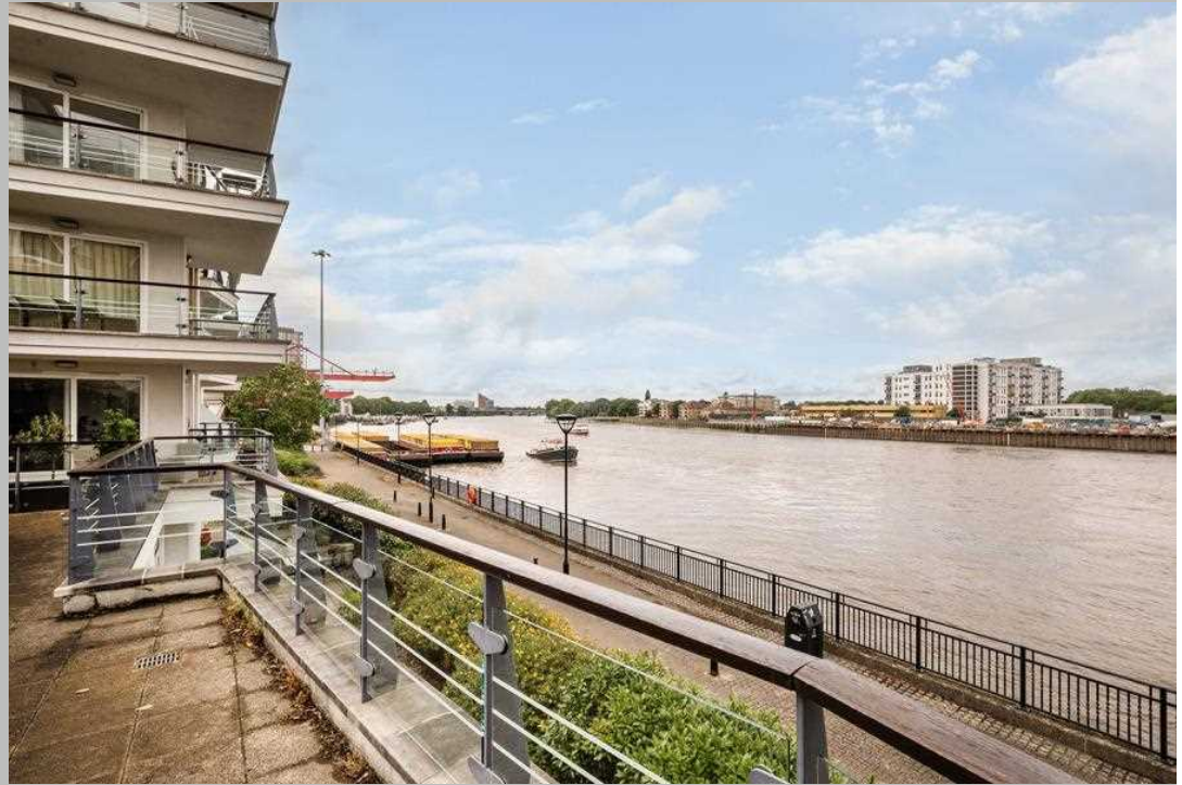
Modern two bed two bath flat with stunning river views