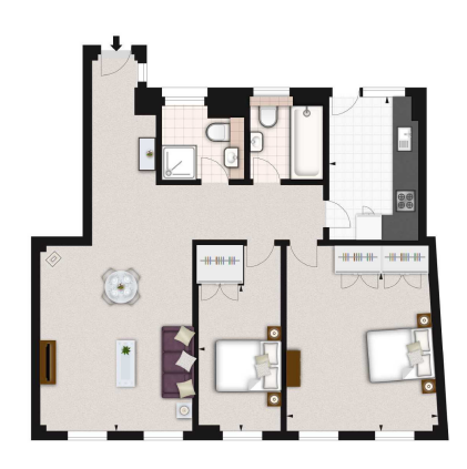
ILLUSTRATION FOR IDENTIFICATION PURPOSES ONLY. NOT TO SCALE

APPROX. GROSS INTERNAL AREA * 824 Ft 2 - 76.55 M 2