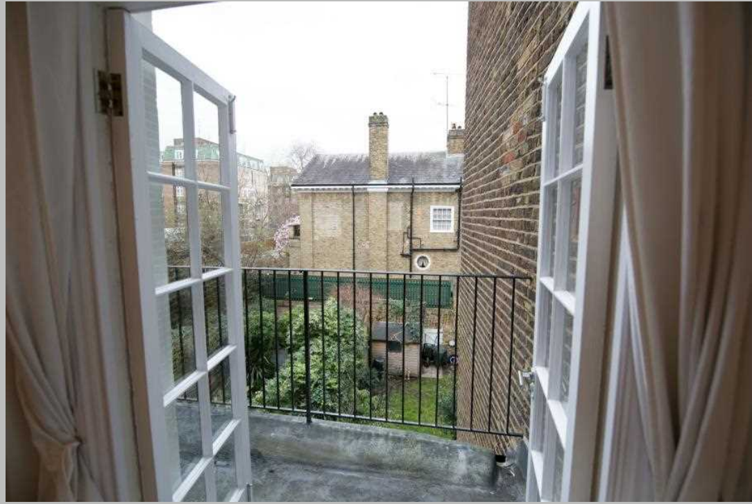
An exquisitely presented two double bedroom apartment in the heart of Kensington