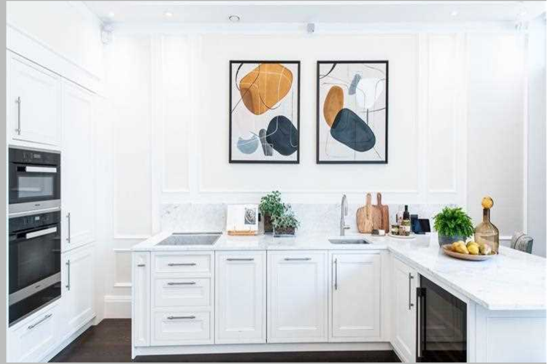
A magnificent two-bedroom duplex apartment within an elegant Victorian building in the heart of Kensington.