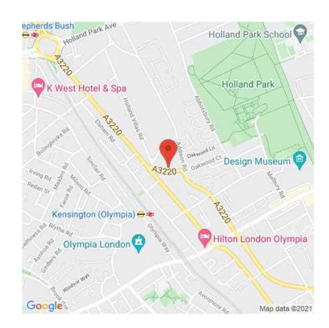
Illustration for identification purposes only, measurements are approximate, not to scale.