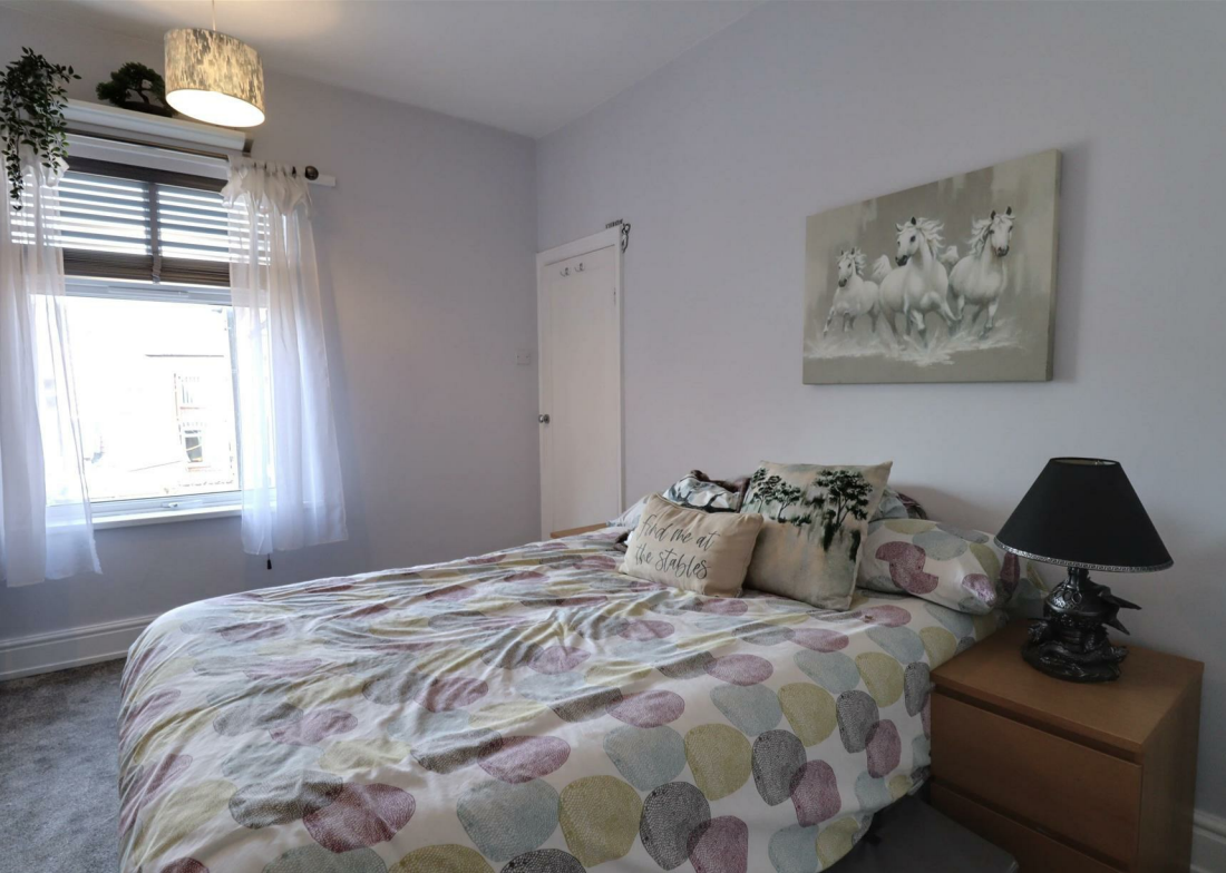
Bedroom One 15'1" x 12'1" (4.6m x 3.7m)