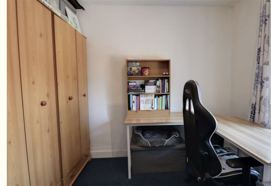
Bedroom Two 13'5" x 9'6" (4.1m x 2.9m)