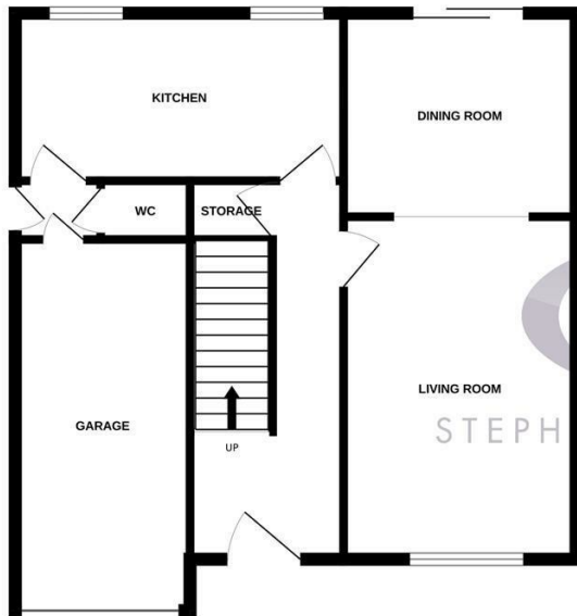
GROUND FLOOR 639 sq.ft. (59.4 sq.m.) approx.