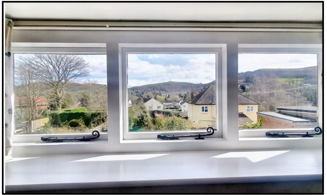
61 HIGH STREET, CHURCH STRETTON, SHROPSHIRE, SY6 6BY