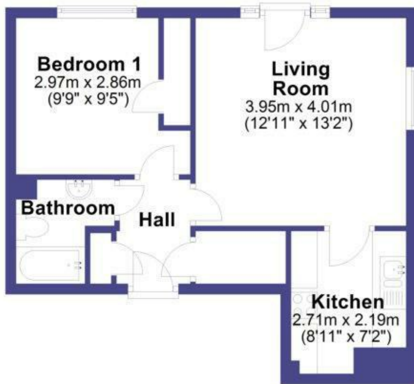
Not to scale. For illustration purposes only. Plan indicates property layout only. Plan produced using PlanUp.

These particulars, whilst believed to be accurate are set out as a general outline only for guidance and do not constitute any part of an offer or contract. Intending purchasers should not rely on them as statements of representation of fact, but must satisfy themselves by inspection or otherwise as to their accuracy. No person in this firm's employment has the authority to make or give any representation or warranty in respect of the property.