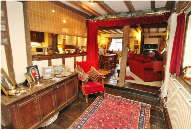
Lounge/Diner 22'10" x 17'8" (6.97 x 5.39)