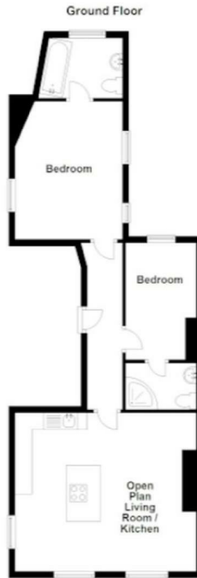
28 Oswald Road – Flat A