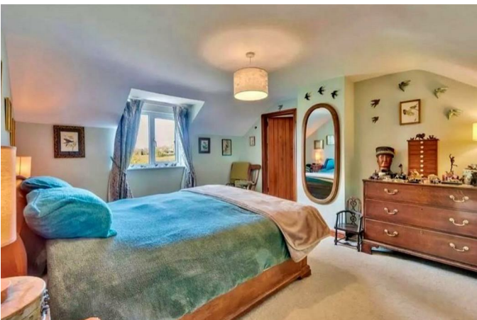
Bedroom One 14'0" x 12'1" (4.27m x 3.69m)

A good sized double bedroom with a window to the front with fantastic views, a radiator and a door which leads through to the en-suite.