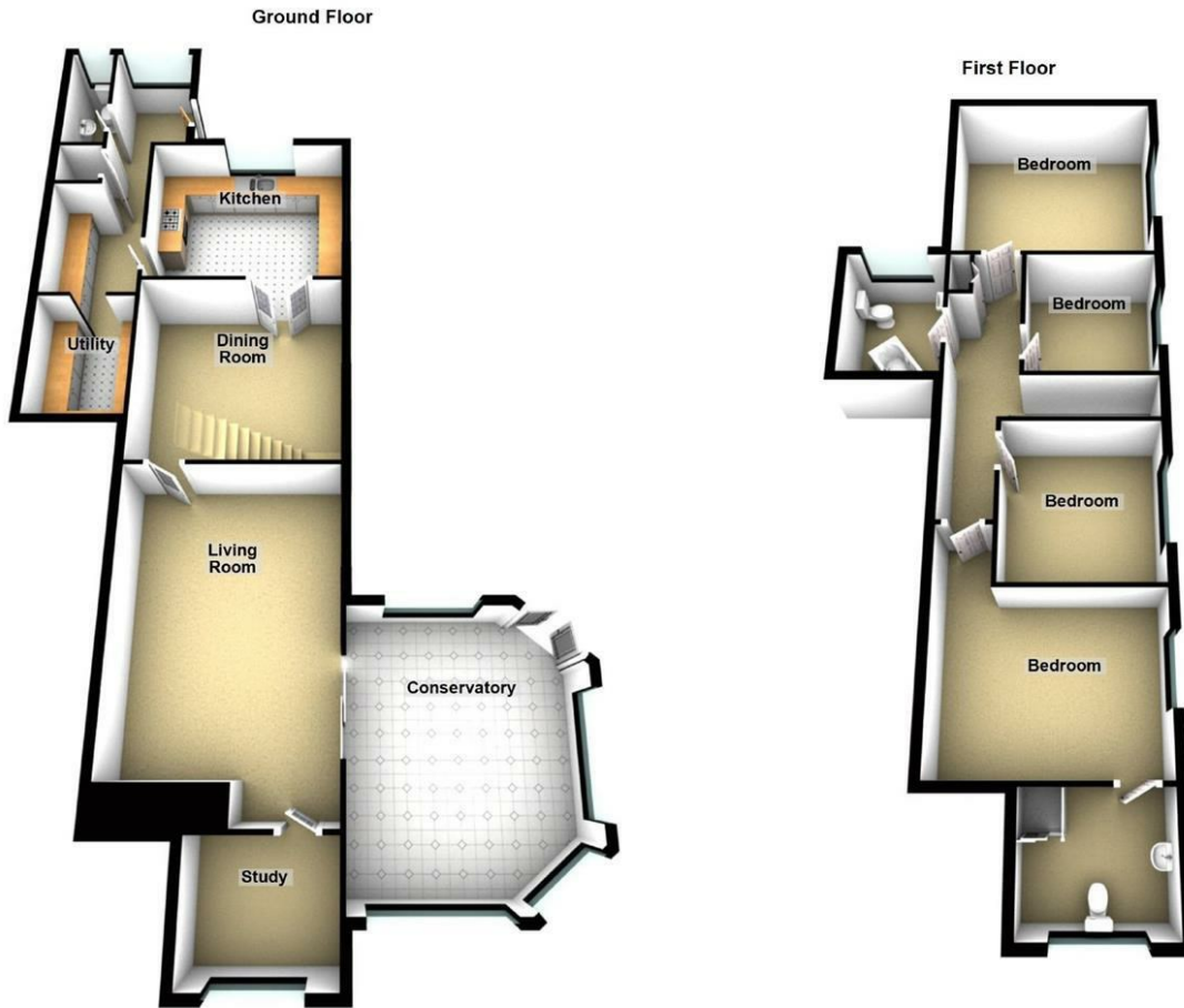
Artists impression, for illustration purposes only. All measurements are approximate. Not to Scale. Direct Dial 07973 205 007 Plan produced using PlanUp.