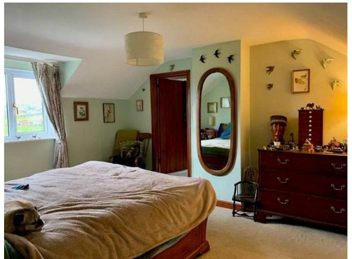
Bedroom Two 13'10" x 10'11" (4.22m x 3.35m)