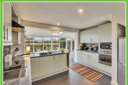
Hobnob House , Maesbury Marsh, SY10 8JH