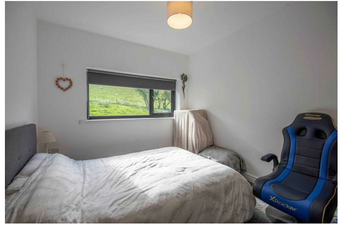
Bedroom Two 10'3" x 8'8" (3.12 x 2.63)

With a window to the rear, vertical radiator and a loft hatch.