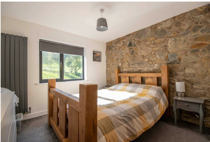
Bedroom One 10'3" x 9'11" (3.13 x 3.02)

With a window to the rear, vertical radiator and exposed stone work.