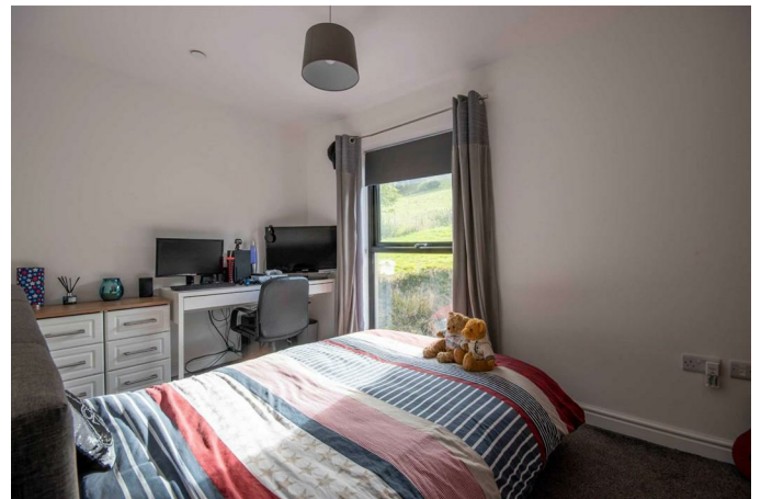
Bedroom Three 11'11" x 7'5" (3.64 x 2.26)

With a full length window to the rear, vertical radiator and a built in cupboard.