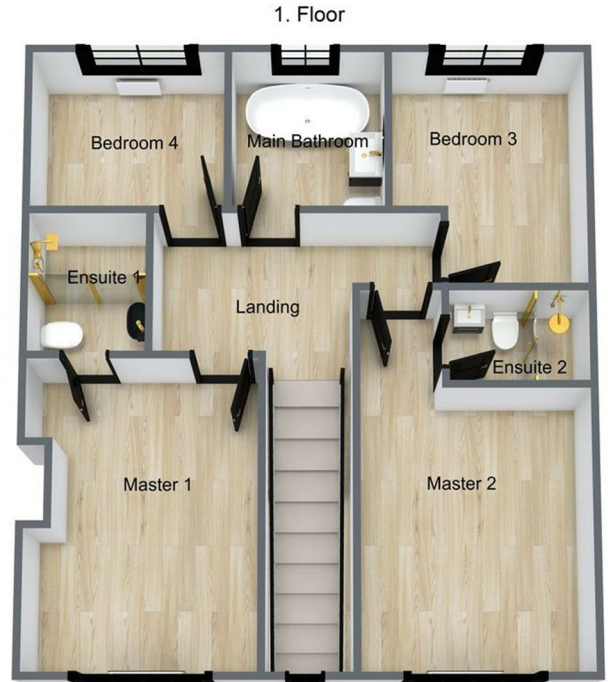
Holly Cottage Upstairs