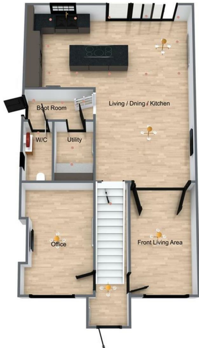
holly cottage new 1. Floor