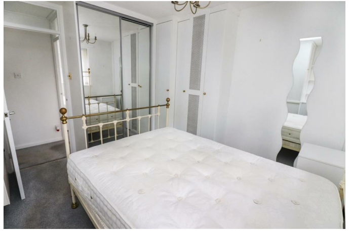
Bedroom Two 10'9" x 6'8" (3.30m x 2.05m)