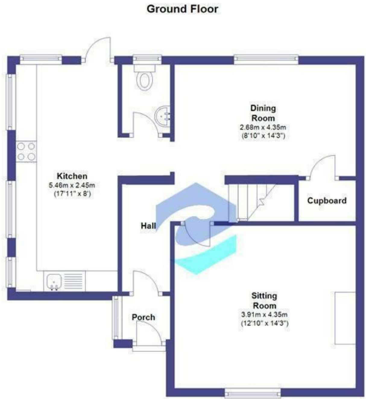
Not to scale. For Illustration purposes only. Plan produced using PlanUp.

Floor Plan: Not to scale ~ For identification purposes only.