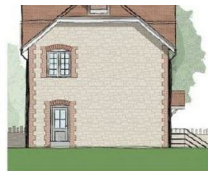
Dwelling 2 - North Elevation 1:50