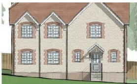
Dwelling 2 - West Elevation 1:50