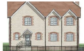
Dwelling 3 - South Elevation 1:50