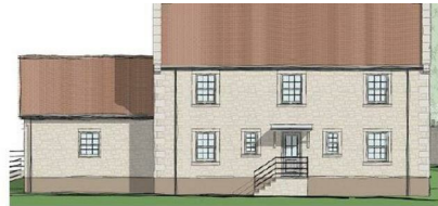
Dwelling 1 - South Elevation 1:50