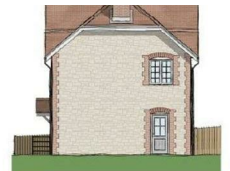
Dwelling 3 - East Elevation 1:50