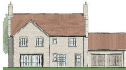
Dwelling 3 - South Elevation 1:50