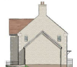
Dwelling 3 - East Elevation 1:50