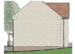
Dwelling 1 - East Elevation 1:50