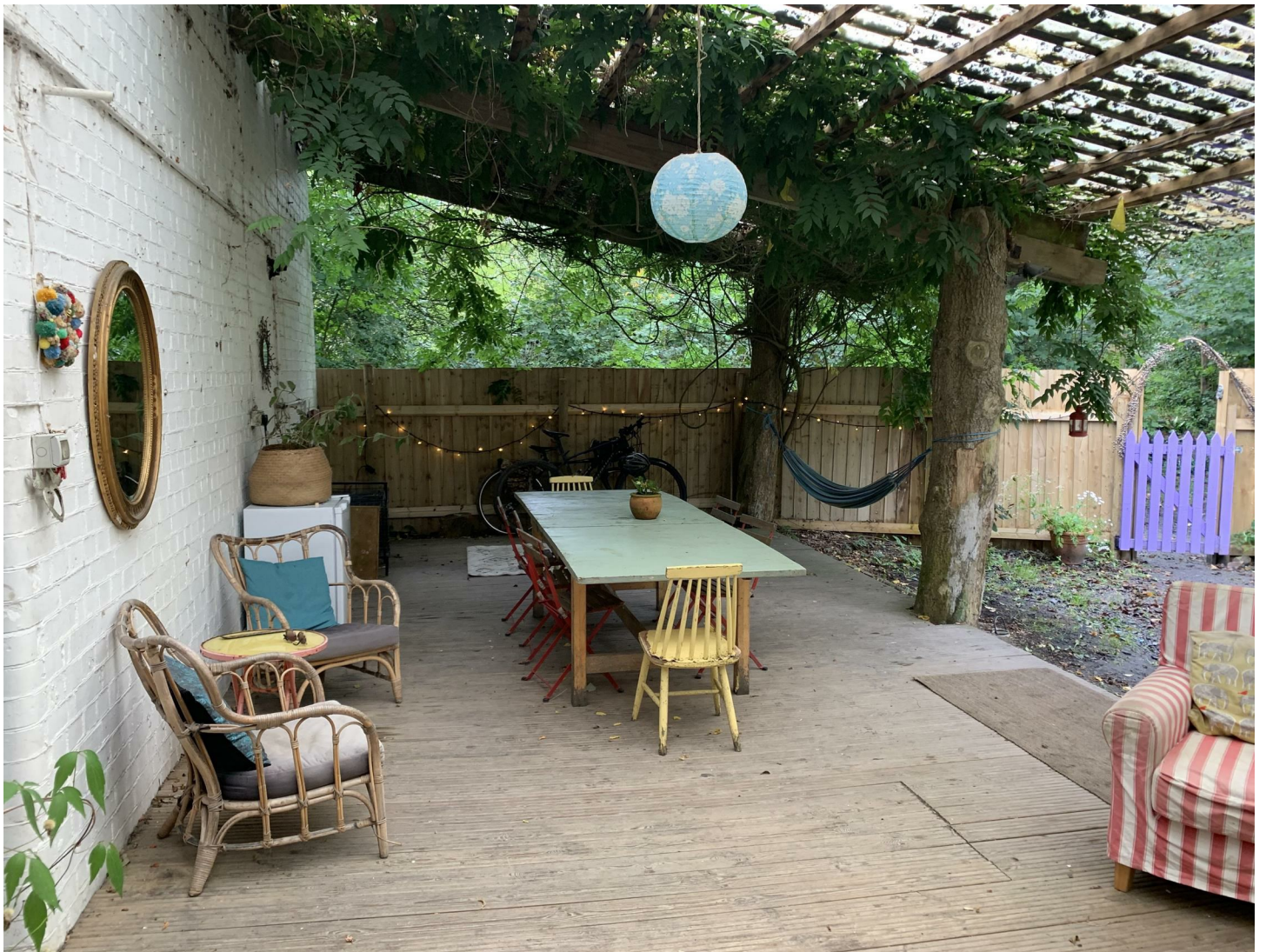
The Coach House