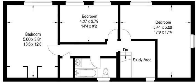
The Coach House- First Floor

(Not Shown In Actual Location / Orientation)