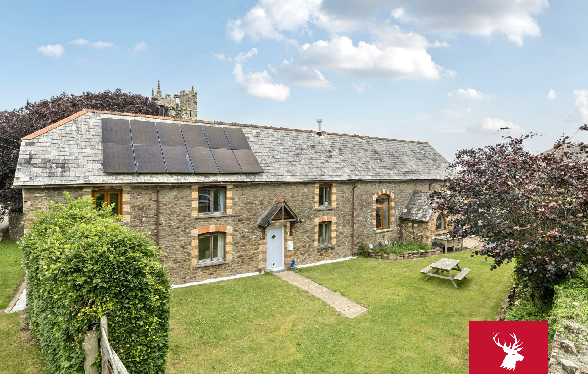
Old School House